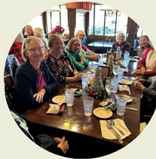
Memories we'll treasure forever